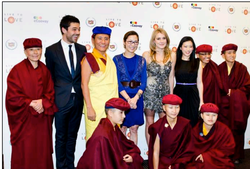
Photo from a private screening at BAFTA London, with the H.H. the Gyalwang Drukpa and the "Kung Fu Nuns" featured in the film.